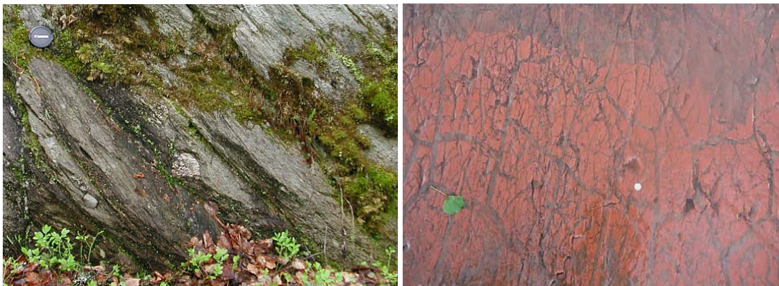
Dropstones in Sariolian tillites at river Luzhma (left). Desiccation cracks on bedding surface of the red-bed siltstone at the Gormozerka Stream mouth (right).