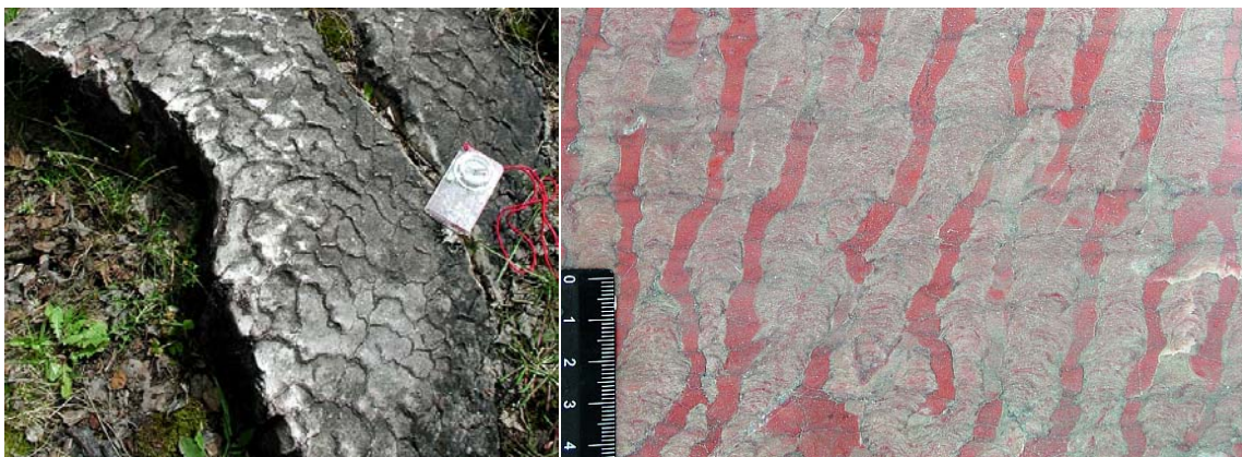
Closely spaced stromatolite columns (Nucleophyton) on the bedding surface of dolostone (left). Polished slab of red dolostone with longitudinal view of branching columnar stromatolites (Parallelophyton; right).