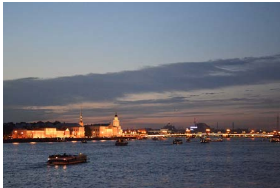
Institute of Precambrian Geology and Geochronology (left). View of River Neva from near the IPGG (right).