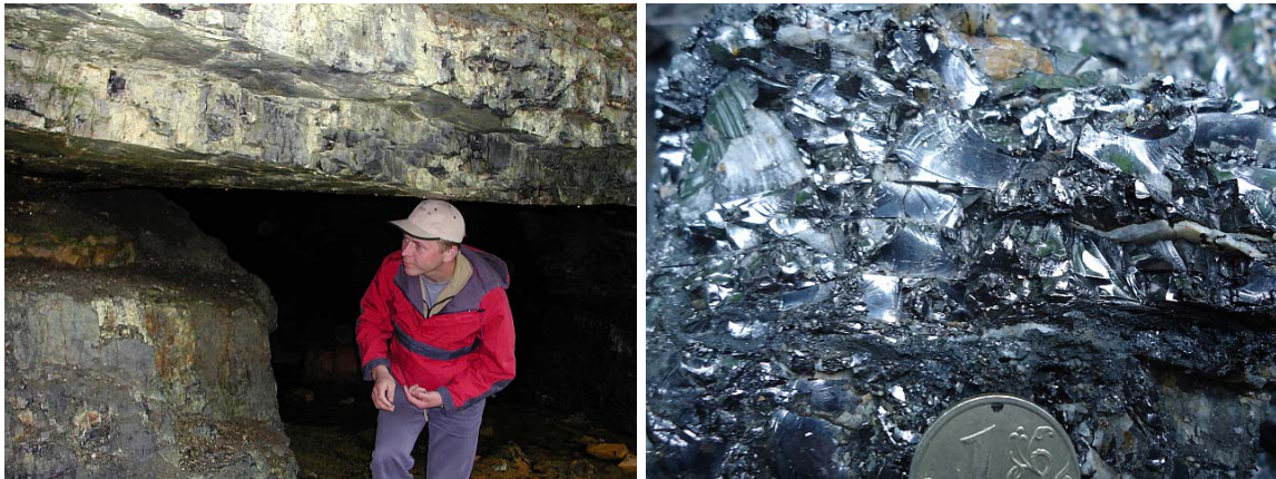
Entrance of an old mine adit in Shunga village (left). Sample of Shungite (anthraxolite, pyrobitumen; right)

The geological record of Karelia comprises world-famous volcano-sedimentary successions that have provided key data for the understanding of surface processes on the early Earth. The Archaean greenstone successions have recorded very different physico-chemical conditions of the ancient Earth surface, and are the prime target for the study of the co-evolution of the atmosphere, hydrosphere, and biosphere. Palaeoproterozoic successions in Karelia host a well-preserved record of diversified life and contain proxies for one of the Earth major revolutions in surface conditions - the Great Oxidation Event. Nowhere else in Europe can such a diverse and well-preserved assemblage of rocks be investigated in the field.