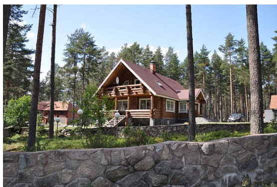
Centre of Petrozavodsk (left). Cabin at Malaya Medveghka (right).